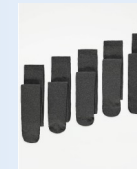
Grey tights or socks