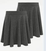
Grey dress, trouser, skirt