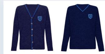
Jumper/Cardigan must have school logo

It is very important to write your child's name on their clothes/coats.