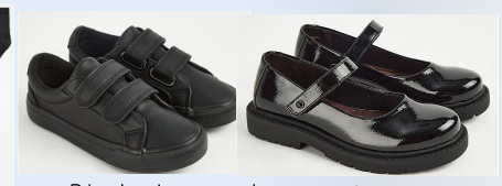
Black shoes only - no trainers

In the summer, boys can wear grey shorts and girls can wear pale blue checked summer dresses with white socks.