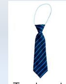
Tie bought from school