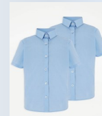
Pale blue shirt (not t-shirt)