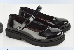
Black shoes only - no trainers

In the summer, boys can wear grey shorts and girls can wear pale blue checked summer dresses with white socks.